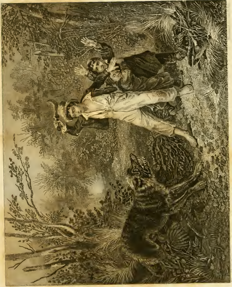
THE BRAVE BROTHER.